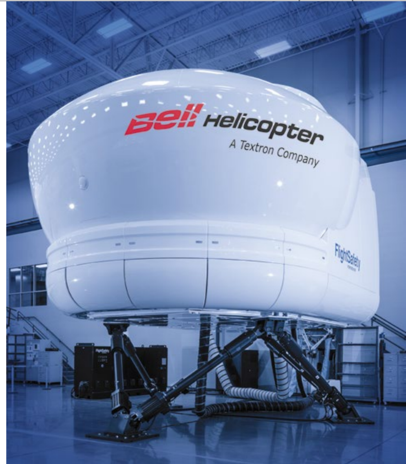
FlightSafety's new FS1000 Level D qualified full flight simulator.