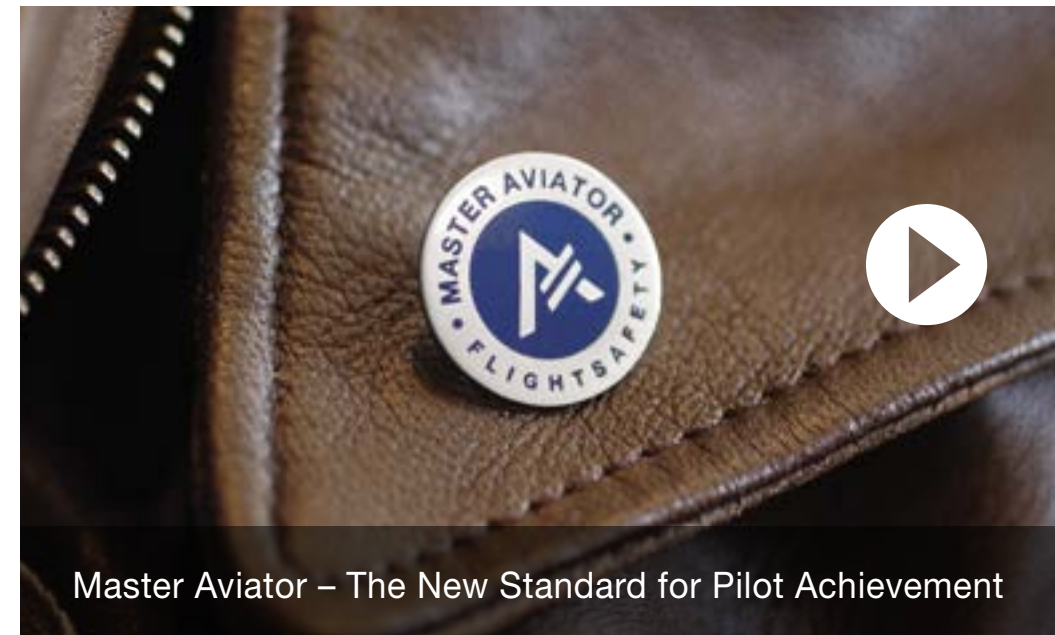
Master Aviator – The New Standard for Pilot Achievement