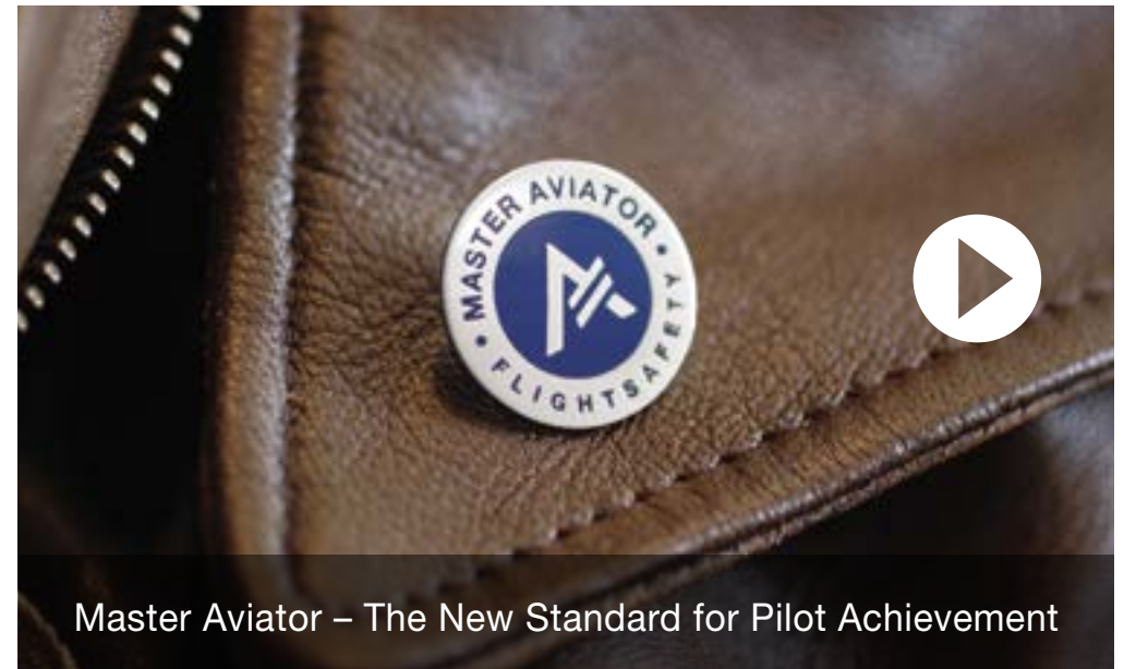
Master Aviator – The New Standard for Pilot Achievement